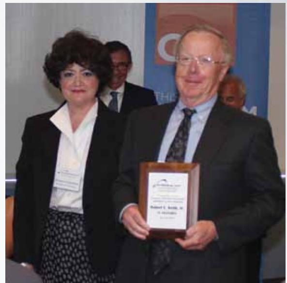
June 26, 2012 Executive Leaders Radio CEO Philanthropy Awards