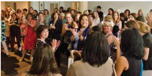
June 26, 2012 Alliance of Women Entrepreneurs (AWE) Summer Social