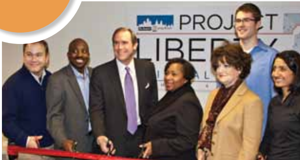
January 4, 2012 Project Liberty Digital Incubator First Class