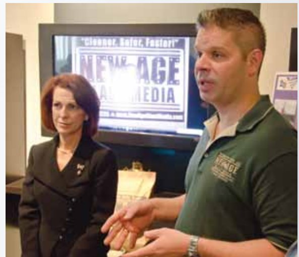
March 19, 2012 U.S. Small Business Administration Intermediary Lending Pilot Program Funding Ceremony