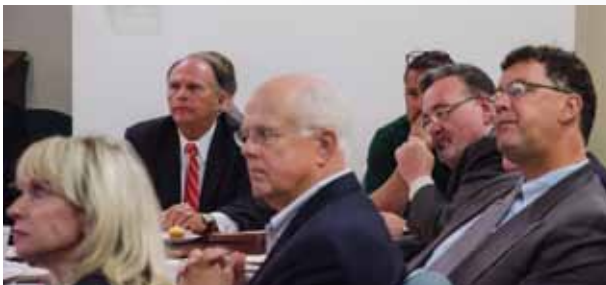
September 12, 2012 Ben Franklin Legislative Roundtable